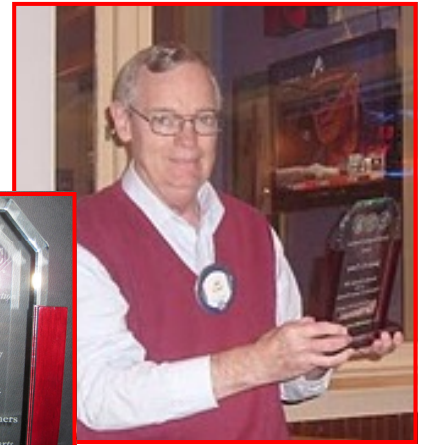
Christian D. Larson Award